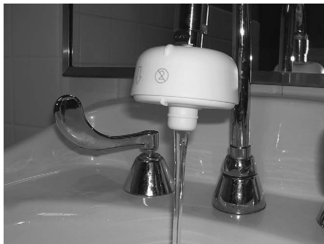
Fig 1. Faucet with point-of-use water filter attached to the outlet.

One hundred twenty-milliliter hot water samples were collected from each faucet in sterile specimen bottles. The hot water temperature was 40°C to 45°C. One hot water sample was collected immediately after opening the valve (immediate sample), and a second sample was collected after a 1-minute flush (post-sample). After the initial sampling, the water filter was attached to 4 of the sink faucets, following the manufacturer's installation directions. Filters were changed weekly (1 test cycle). Two test cycles had a duration of 2 weeks. Sampling was repeated until 12 cycles had been completed. At the end of each cycle, immediate and postflush samples for the last sample day were obtained, and then the filter was changed. Because the water had already been running, we did not collect a postflush sample for the newly installed filters at T = 0 . Four faucets were equipped with filters (Fig 1), and 3 faucets had no filters attached and represented the "Control" faucets. A total of 594 water samples was collected over the 12 test cycles.