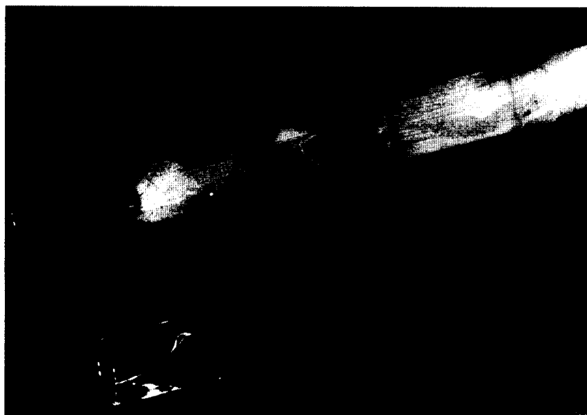
Fig 2. Scale accumulation on the quartz sleeves housing the ultraviolet lamps impairs uv transmission (above). Prefiltration prevented scale accumulation on the surface of the quartz sleeve (below).

strongly recommended to prevent accumulation of scale on the quartz sleeves that would compromise the intensity of the ultraviolet irradiation. In one hospital, recolonization of Legionella occurred within weeks for ultraviolet light without prefiltration whereas no recolonization was found for 3 months using ultraviolet light with prefiltration. 56